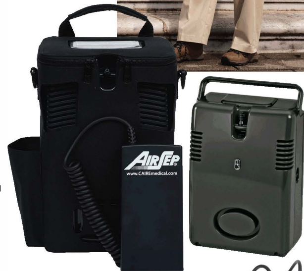
FreeStyle 5 shown with new carrying case and External Battery Cartridge