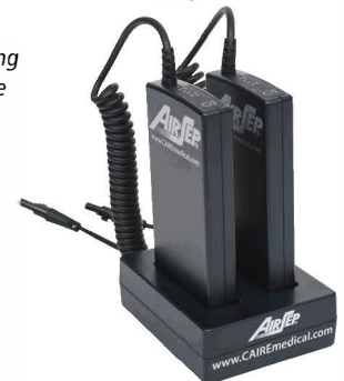
External Power Cartridge and Charger Combo (BT026-1); includes battery (1), charger (1), and power supply (1)

Call 1.877.774.9271 to order! www.oxygenconcentratorstore.com